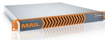
Astaro Mail Gateway 3000