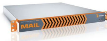
Astaro Mail Gateway 2000